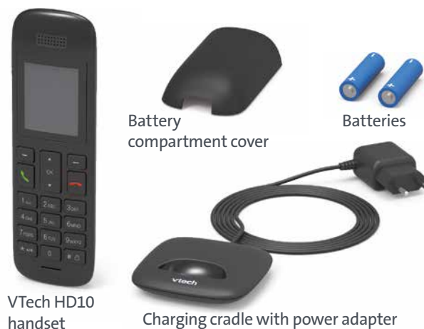
VTech HD10 handset