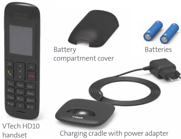
VTech HD10 handset